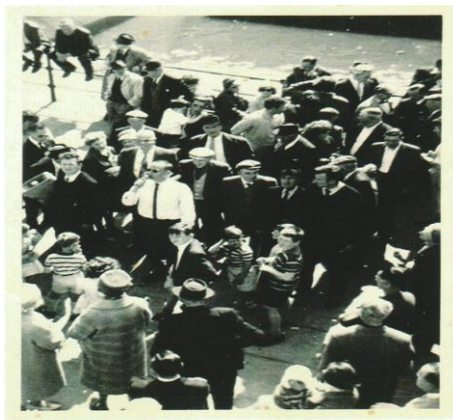
Open air Preaching at the Pierhead, Liverpool

you said it and keep your word. When the revival in this church faltered, I left the