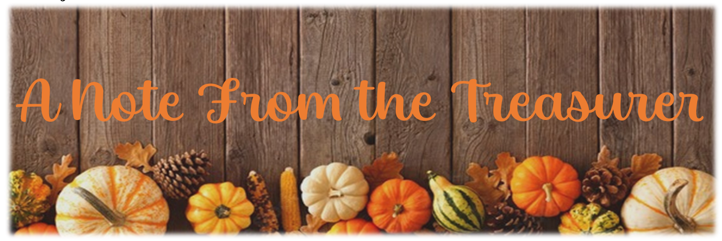
**Support Trinity United Methodist Church with PayPal Donations!**