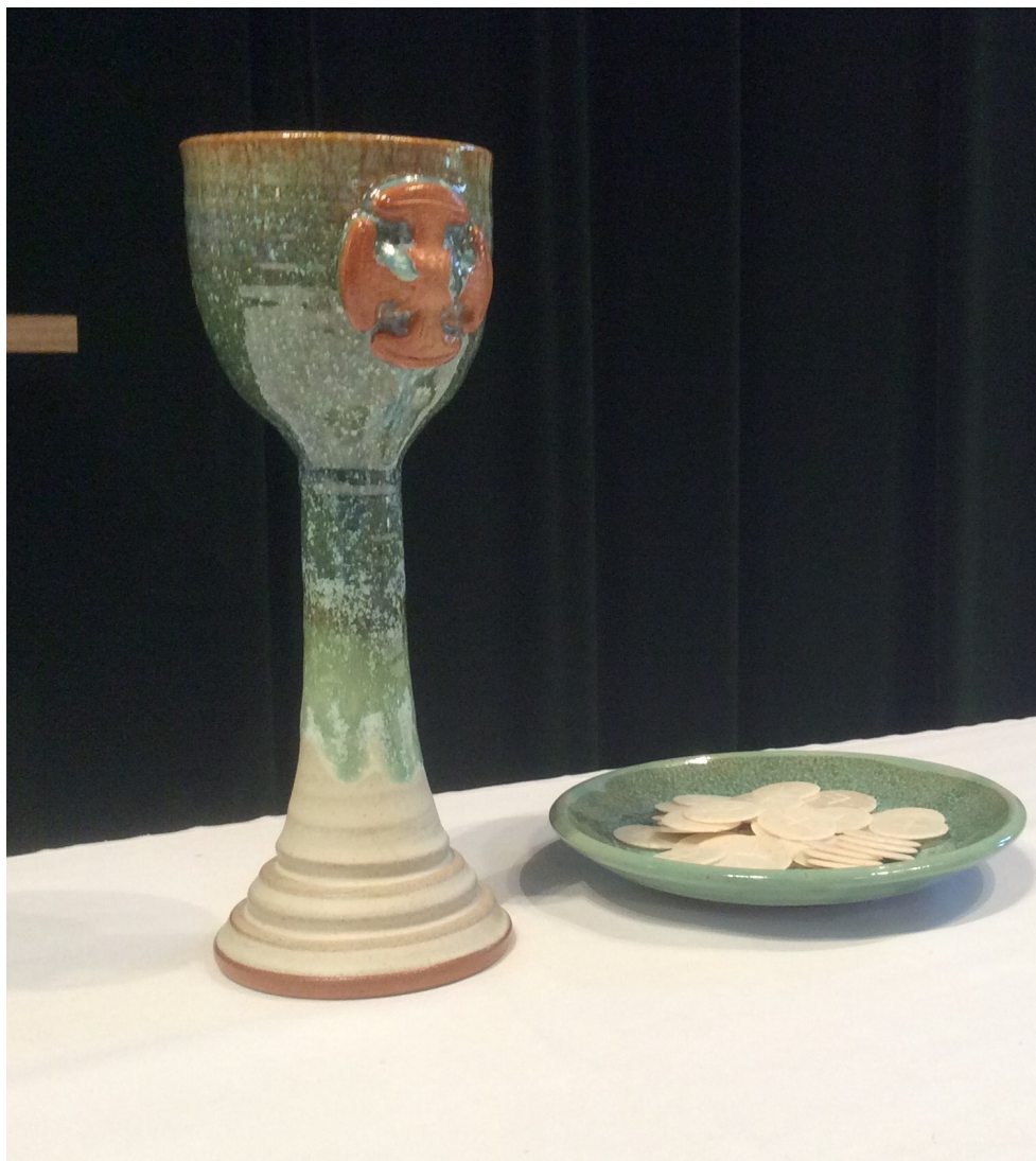
The 20th Sunday after Pentecost: Proper 24 Holy Eucharist Rite II October 18, 2020