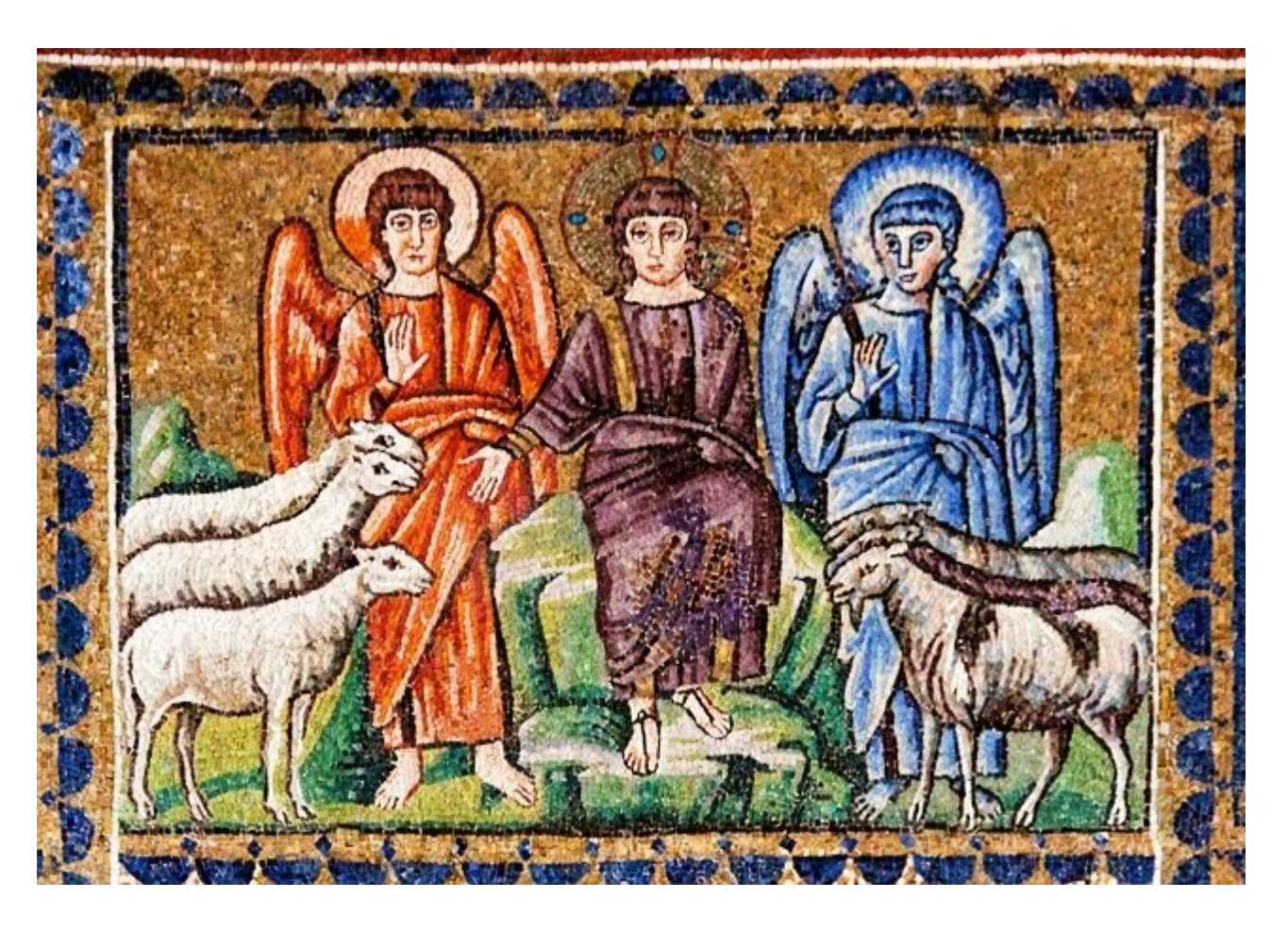
The Last Sunday after Pentecost: Proper 29 Holy Eucharist Rite II November 22, 2020