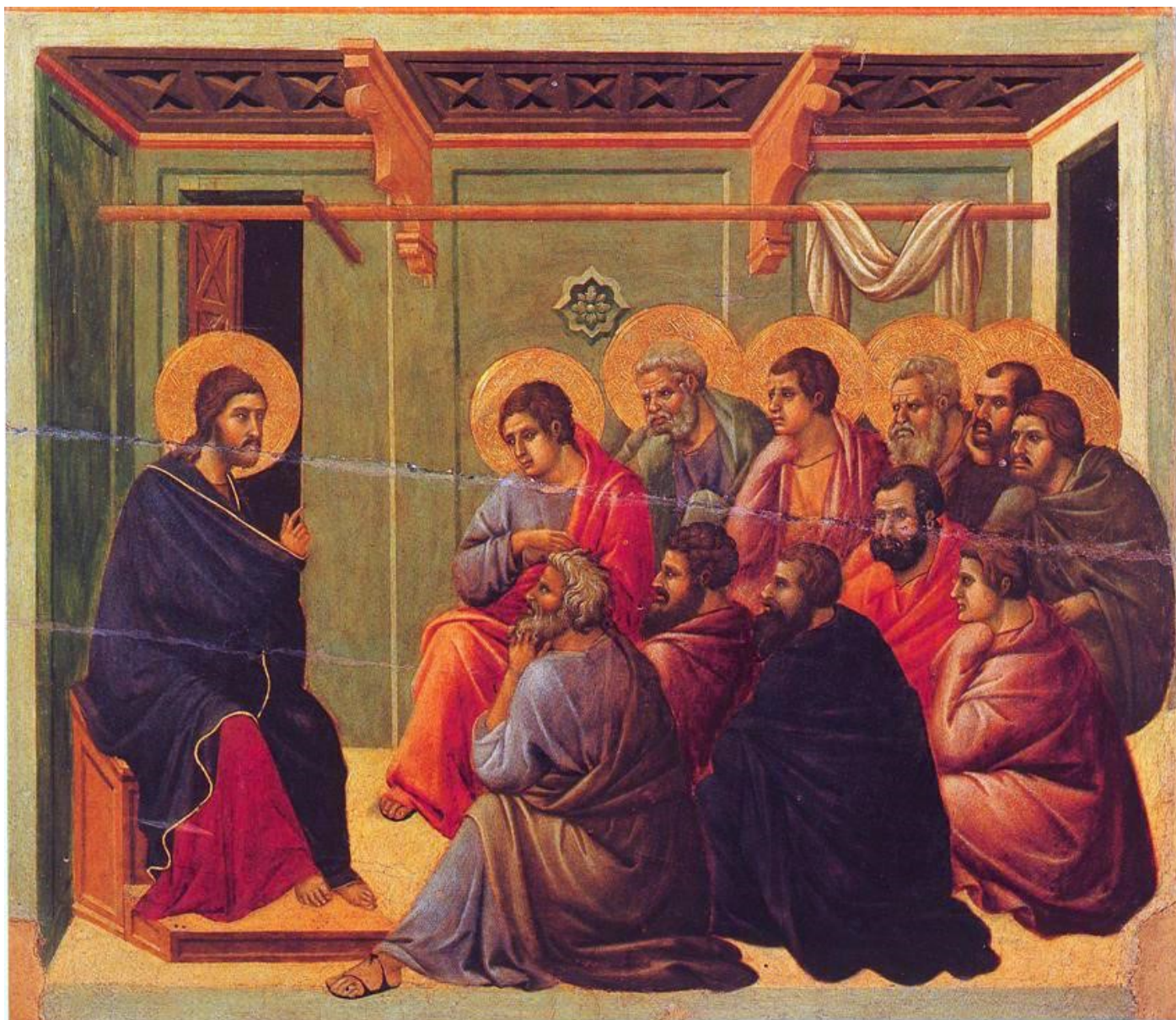
Seventh Sunday of Easter Holy Eucharist Rite II May 12, 2024