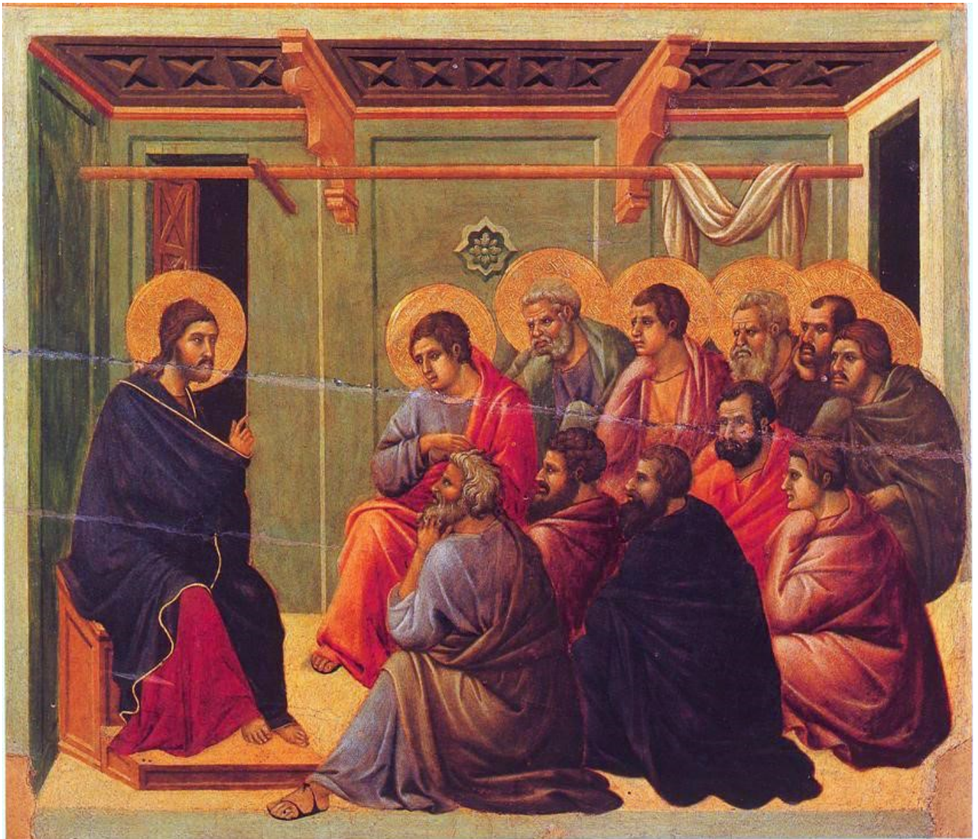
Seventh Sunday of Easter Holy Eucharist Rite II May 12, 2024