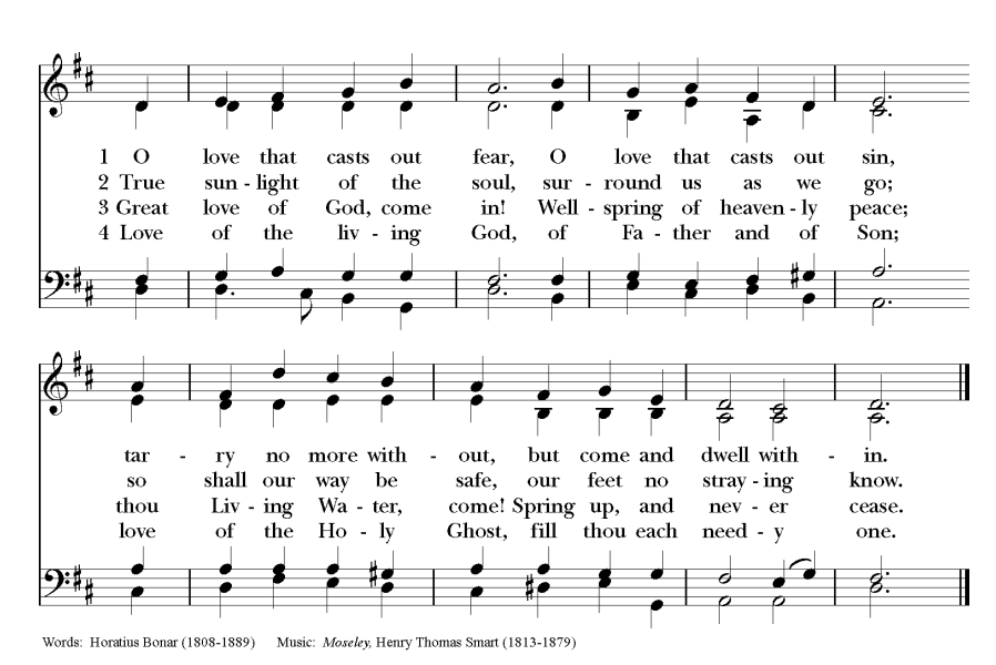
Hymn O love that casts out fear H-700

What then? Should we sin because we are not under law but under grace? By no means! Do you not know that if you present yourselves to anyone as obedient slaves, you are slaves of the one whom you obey, either of sin, which leads to death, or of obedience, which leads to righteousness? But thanks be to God that you, having once been slaves of sin, have become obedient from the heart to the form of teaching to which you were entrusted, and that you, having been set free from sin, have become slaves of righteousness. I am speaking in human terms because of your natural limitations. For just as you once presented your members as slaves to impurity and to greater and greater iniquity, so now present your members as slaves to righteousness for sanctification. When you were slaves of sin, you were free in regard to righteousness. So what advantage did you then get from the things of which you now are ashamed? The end of those things is death. But now that you have been freed from sin and enslaved to God, the advantage you get is sanctification. The end is eternal life. For the wages of sin is death, but the free gift of God is eternal life in Christ Jesus our Lord.