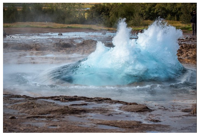
We will visit Geysir, on the Golden Circle route

We will start as we mean to go on with a day rammed full of incredible natural wonders: enjoy the amazing attractions available on the Golden Circle , including Gullfoss, Geysir and the UNESCO World Heritage Site of Thingvellir. Then on your way home, you will see Seljalandsfoss and Skógafoss waterfalls.