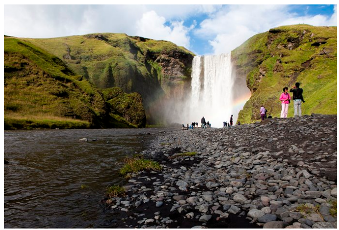
Skogafoss waterfall is one of the stops on the south coast