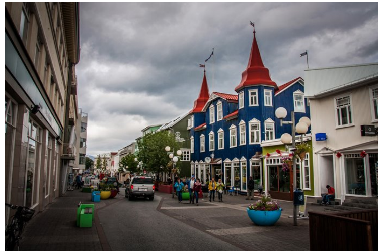
We will visit Akureyri, the largest city in north Iceland