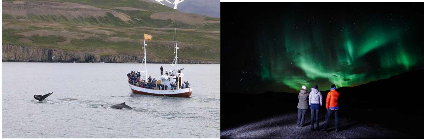
A Whale watching tour is included