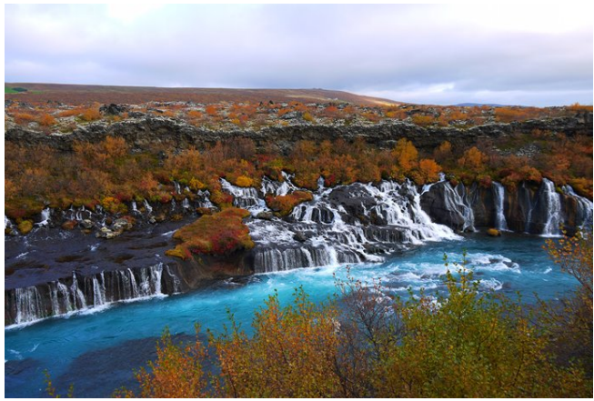
Hraunfossar in West Iceland