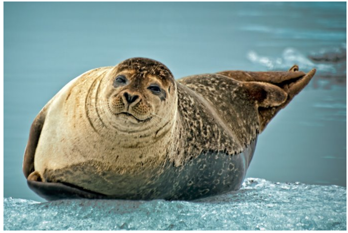
A seal chilling on an iceberg in Jokulsarlon Glacier Lagoon

Overnight - Icelandair Hotel Vik or similar- Meals B