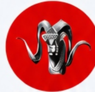
FRONTIER WORKS ORGANIZATION