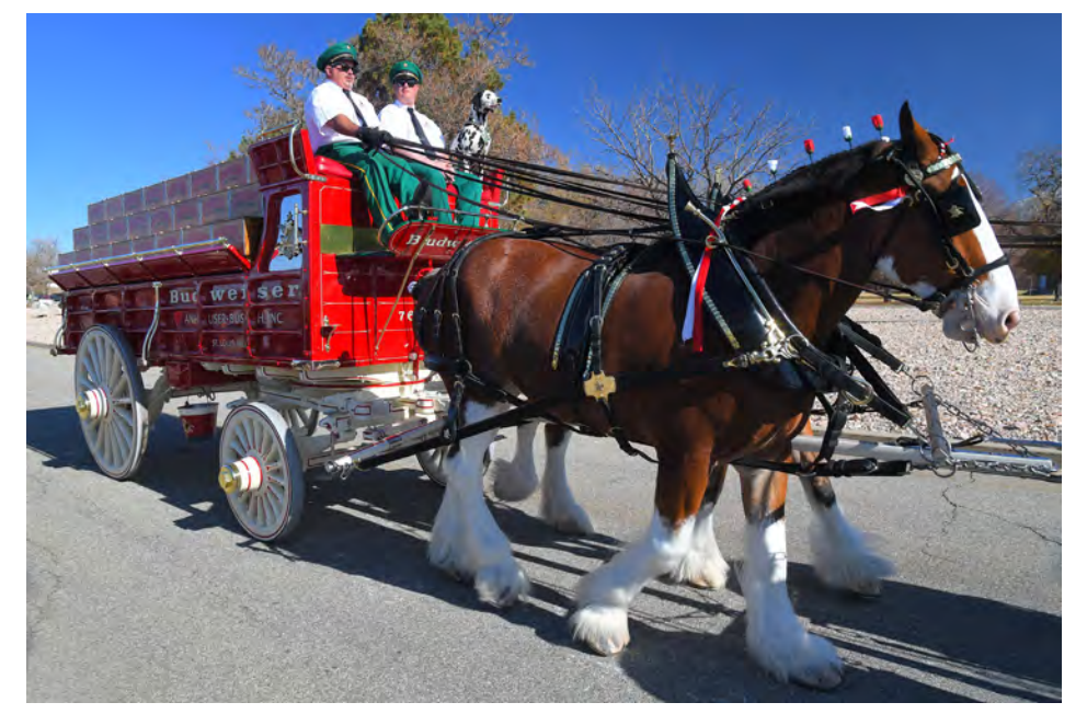
Budweiser Clydesdales, November 2019. Utah.

"Looking Back" is a collection of historical newspaper reports from Gilpin County.