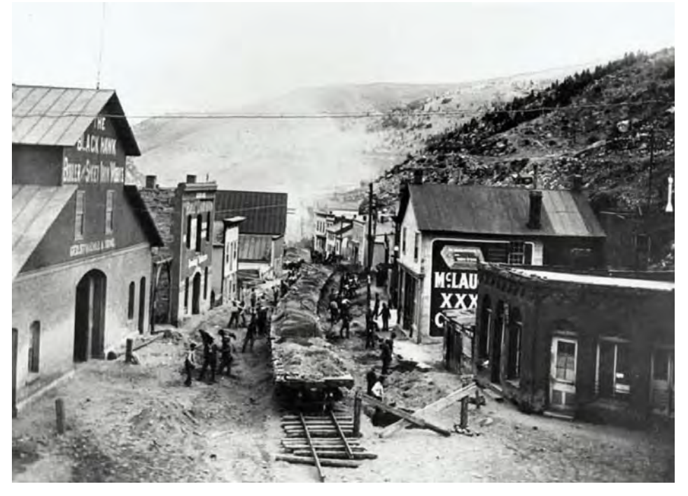
C & S temporary track in Main Street of Black Hawk after the 1910 flood.

Old man winter "just keeps rolling along". Although temperatures this week haven't approached the recordbreaking, pipe-busting, car-stalling temperatures of last week, strong winds Sunday caused heavy drifting throughout the county. Reports from the north end of the county tell of drifts four feet or more. Some mention should be made here of the fine work done by the State and County highway crews during this 2-week storm. They have been out day and night in the sub-zero temperatures and high winds keeping the roads passable and certainly they all deserve a vote of thanks from everyone. Also a tip of the hat to Mr. Joe Menegatti and his crew for the fine job they have done with