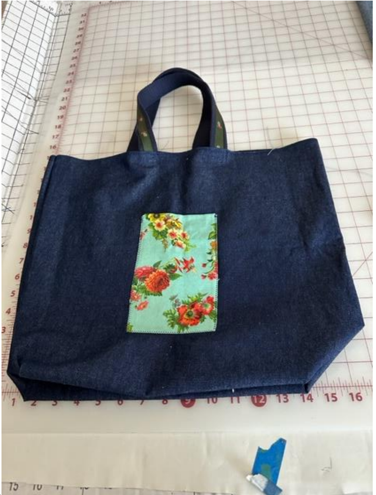
12. 13. Completed CA Tote with pocket.