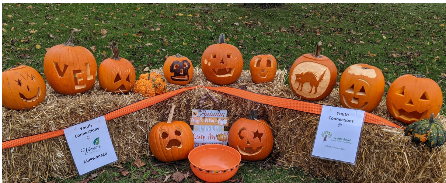
The Youth Connection Jack-o-Lantern's on display at the Jack-o-Lantern Jaunt in Mukwanago.

Opportunities for ministry and fellowship in, through and around All Saints