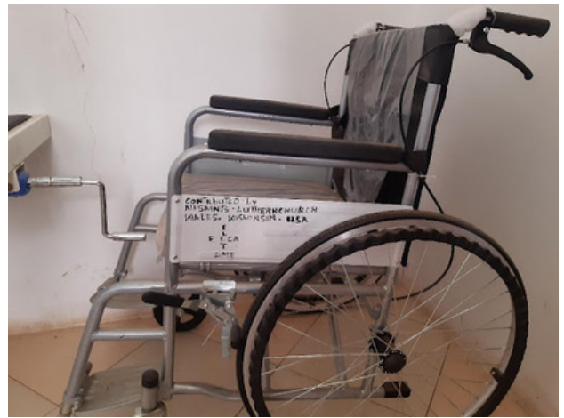
Equipment and furnishings sponsored by All Saints are labeled.

Patients of Songoro Village region are now able to avoid the 1 hour walk to Ngoranga hospital for outpatient medical care. A physician provided by the Usa River District government, as agreed when the clinic was built with funds from All Saints, is now equipped and is busy supplying affordable health care to patients.