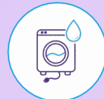
Overflow of Appliances