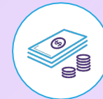
Loss of Rental Income