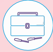
Wear and Tear