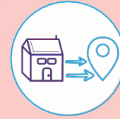
Off Premise Losses