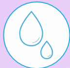
Water Backup of Sewer, Drain or Sump