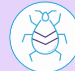
Bed Bug Remediation