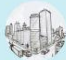
Two-Point Perspective Cityscape