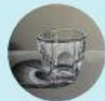
Glass & Water