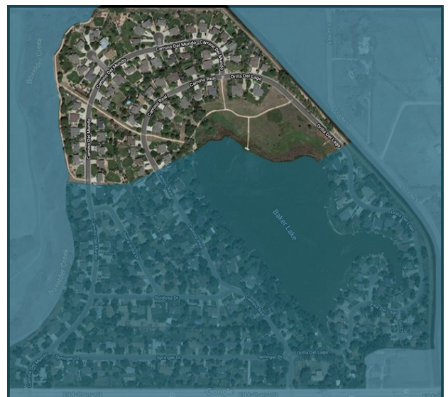
Trails at Vista Bonita HOA