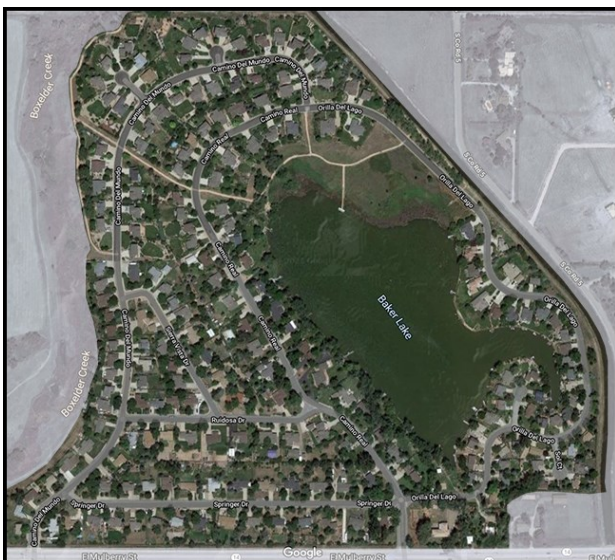
Vista Bonita Recreation Association properties eligible for VBRA membership

Would love to find out who has kids/what ages for walks/playdates. I'm open to arranging this if possible (publish a directory).