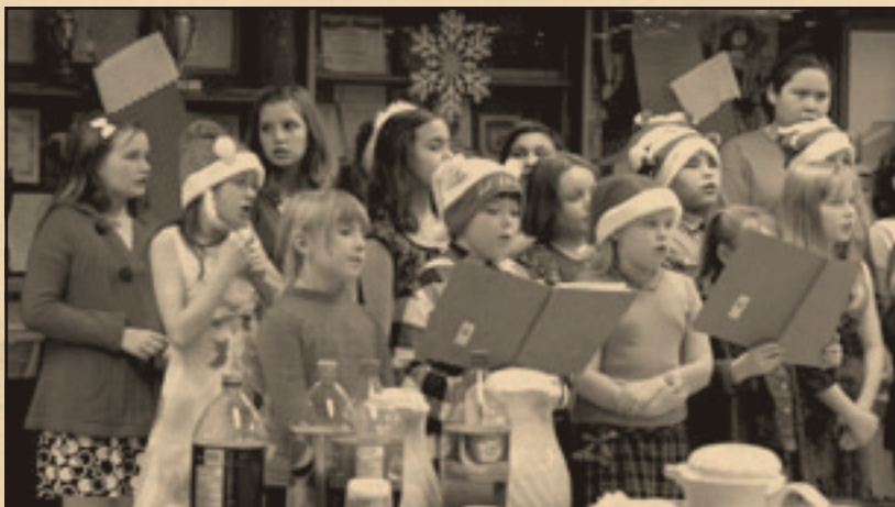
Schumacher Public School Choir at Seniors Christmas Supper