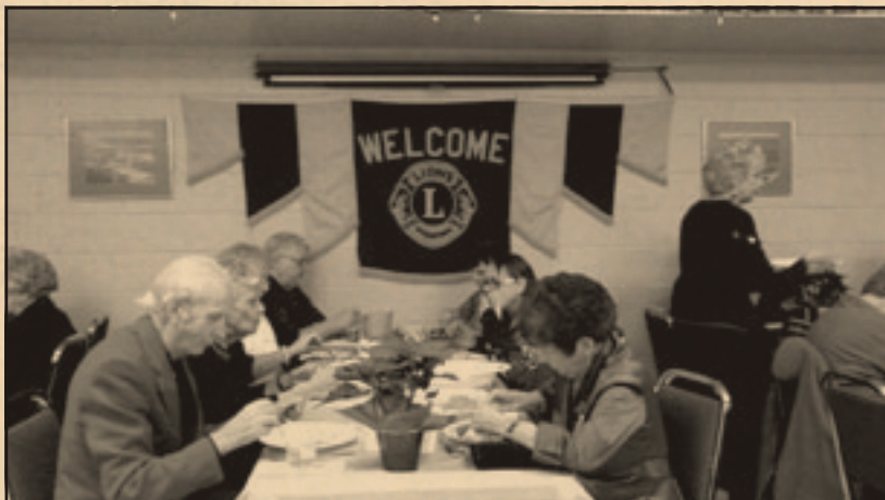
Schumacher Lions Club Seniors Christmas Dinner photo