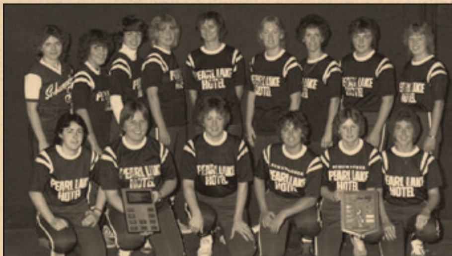
Schumacher Pearl Lake Hotel Junior Giants, Women's Fastball Team, circa 1980's