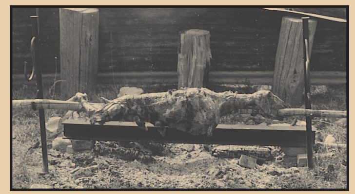
Served with a cold beer, bread, green onions and tomatoes, barbequed lamb has always been the hallmark of Croatian summer gatherings in Schumacher.