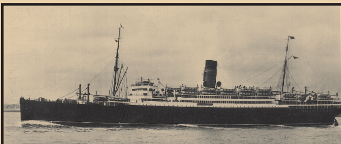
The wives and children of the Polish miners eventually made their way from the German refugee camp across the Atlantic to Canada aboard the Cunard White Line steamship Samaria.