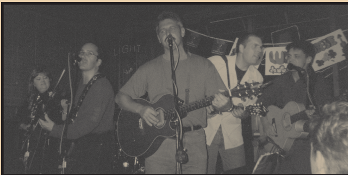
The band Fourth Avenue performing live at Fionn MacCools in 2003.