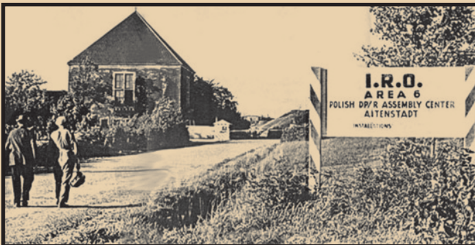
Some (possibly all) of the Polish miners and their families, including the Skarzynskis and Romanowskis, stayed in the Altenstadt refugee camp in Germany before making their way to Canada.