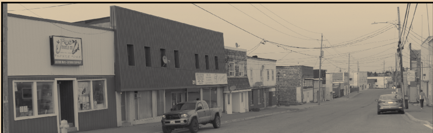
Looking east along Father Costello Drive (First Avenue). The Croatian Hall is to the right of the photo.