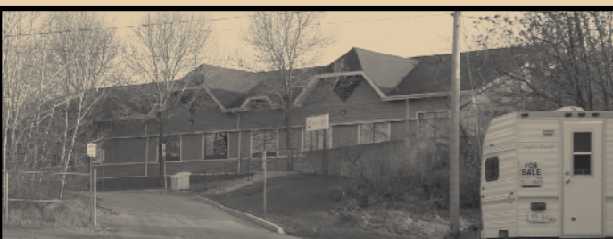
These days, the old St. Francis Catholic School is known as the FW Schumacher Residence and is operated by North Eastern Ontario Family and Children's Services.

A desire to see what Schumacher looks like now is a sentiment shared by many SACHA supporters who no longer live in the area. Some of the community's most prominent building, such as the McIntyre Arena and Schumacher Public School have not changed much over the years. Others, including the CIBC Bank and the three churches, have acquired new owners and been put to new uses. The photos on these pages were taken during an evening stroll in mid May 2016.