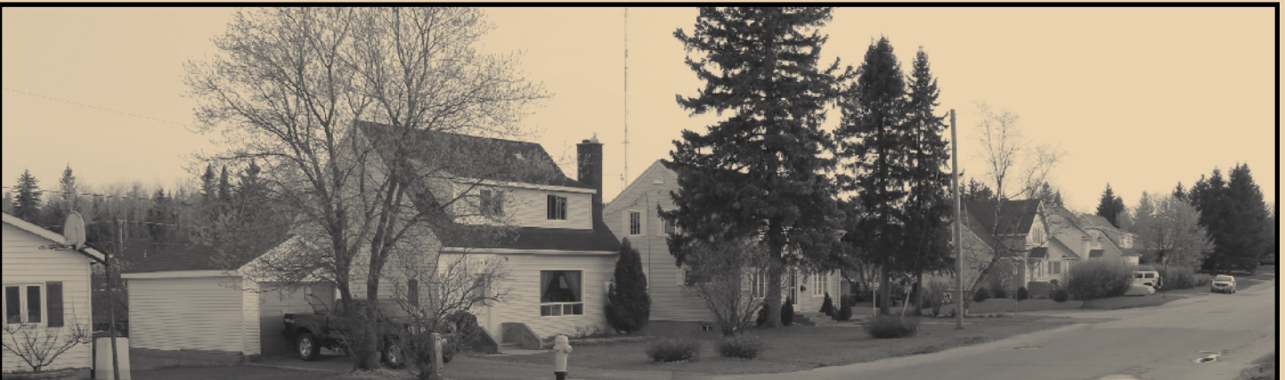
Croatia (Third) Avenue across from the District School Board Ontario North East office, the site of the former Schumacher High School.