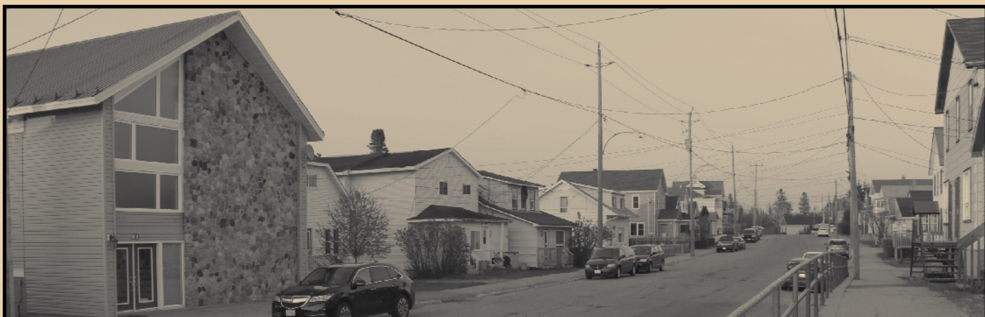
Looking east along Father Costello Drive (First Avenue) with the former Trinity United Church on the left.