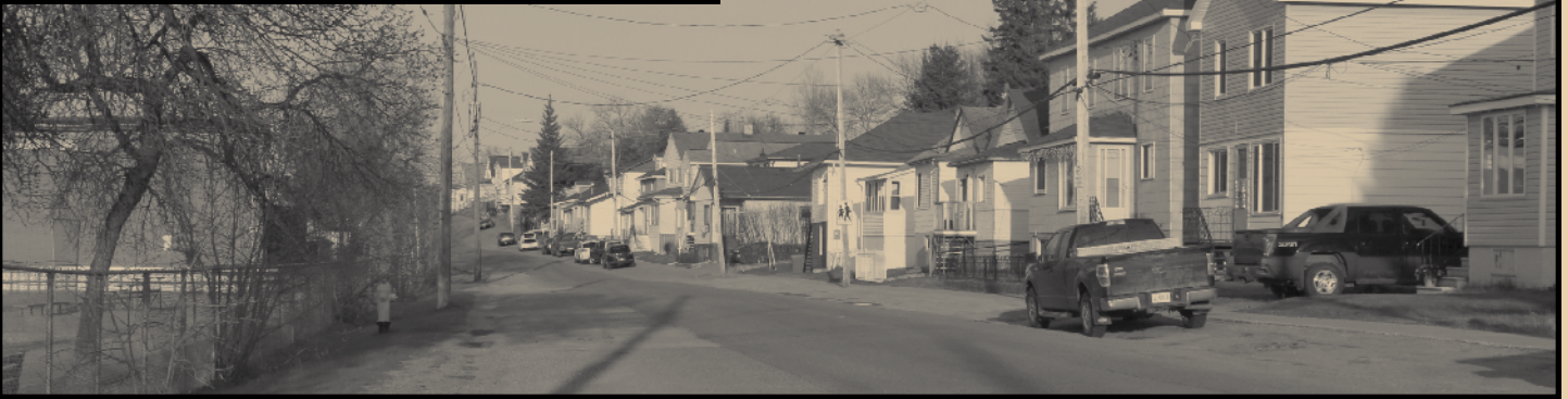
Fourth Avenue, looking west up the hill from the playground at Schumacher Public School. A permanent outdoor rink has been built in the schoolyard and is enjoyed by young and old.