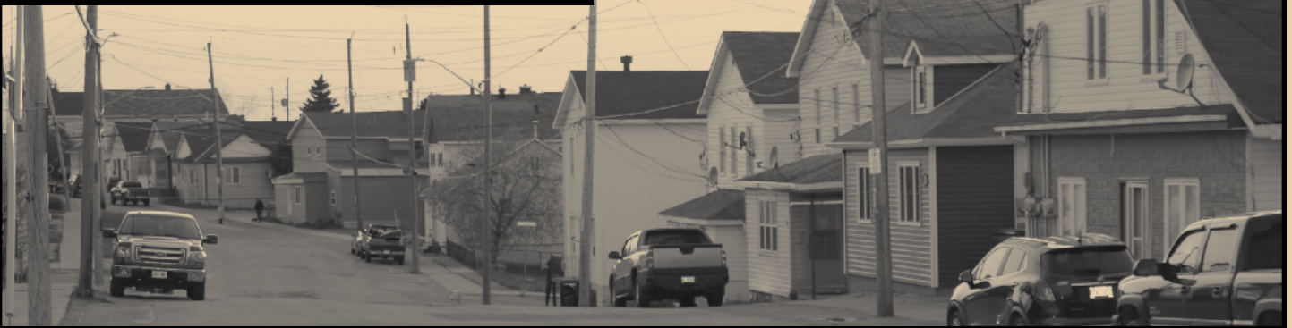
Looking west down Dwyer (Second) Avenue from the corner store. (It's currently a Mac's Milk, but was formerly a Mike's Mart, a Pinto, and a Consumers Co-op.)