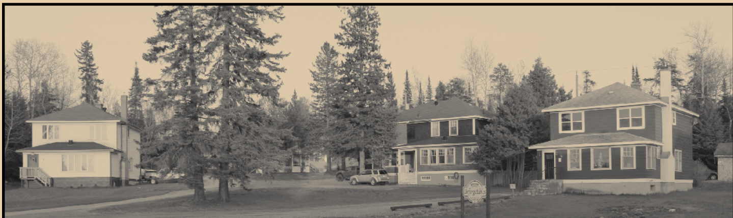
The McIntyre Mine homes still stand on Platt Vet Property. The entire subdivision is currently for sale by a private owner.