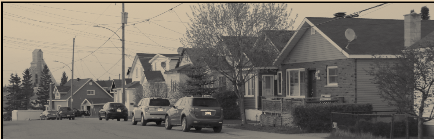
One last view, looking south down Vipond Road (Poplar Street) towards the McIntyre Headframe from the corner of Fourth Avenue.

Until next time, Lisa Romanowski , SOS Editor