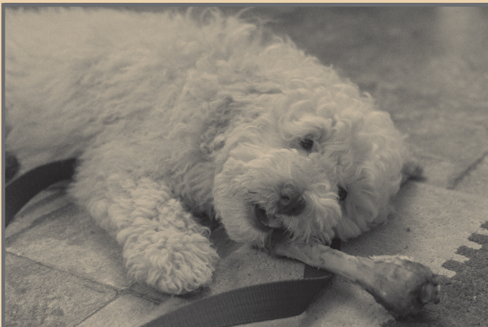
The Dog Days of Summer: The newest addition to our family, Murphy Dunkley, enjoys playing in the schoolyard, swimming in the pool, and chewing on barbecued lamb bones.

This change will come into effect with the Spring 2020 edition of the SOS. Thank you for your understanding and continued support.