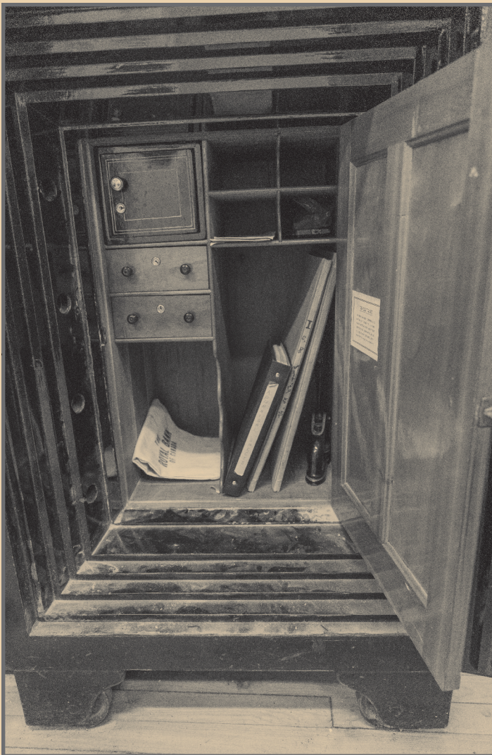
Above: The contents of the second floor safe were revealed during the Schumacher Public School 100th Anniversary celebration on June 7th. Its treasures included old class ledgers, a chunk of gold, a school stamp, and a handful of $2 bills. Below: The gym was converted into a walk down memory lane, complete with a model classroom of days gone by created from odds 'n ends found within the school. Plaques, photo albums, newspaper clippings and other SPS artefacts were also on display.

A highlight of the event was the opening of the 800-pound safe on the second floor. (For those wondering, a crane was apparently used to lift it up there through a window.) At some point many years ago, the keys to the safe were lost. To get it open, school staff convinced a local locksmith to briefly come out of retirement. The effort was worth it as the safe held a few treasures including school ledgers, a stamp of the school, a piece of gold, and a bunch of $2 bills. (As a point of reference, the last time a $2 bill was printed in Canada was in February 1996. It is likely that no current SPS student had ever seen a $2 bill before in their life.)