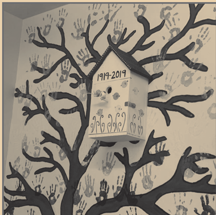
Above: To ensure it doesn't get lost, staff and students created a wall mounted time capsule to be opened in 2069. Below Left: You can't celebrate 100 years without a cake! Below: A banner featuring an updated SPS logo now hangs in the main hallway.

The gym was converted into a walk down memory lane. Current students created posters depicting highlights of what was going on in Canada and the world during each decade of the school's existence. SPS memorabilia (including plaques, photos, and newspaper clippings) was also on display. A model of an old-school classroom was created using odds and ends from around the school. The efforts of the organizing committee did not go unnoticed.