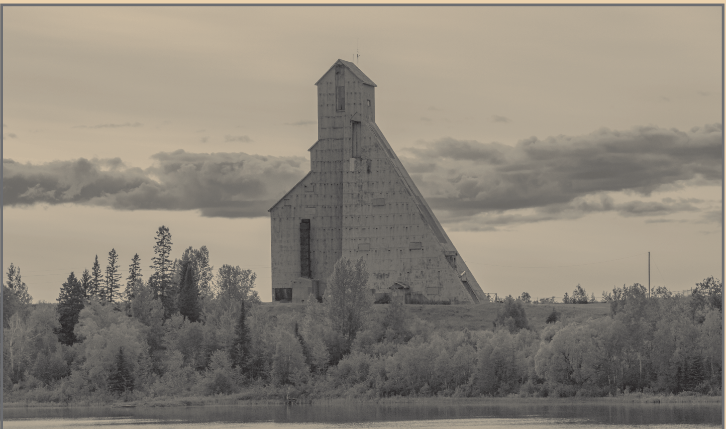
The McIntyre Headframe, which overlooks Pearl Lake in Schumacher, is in need of significant maintenance.