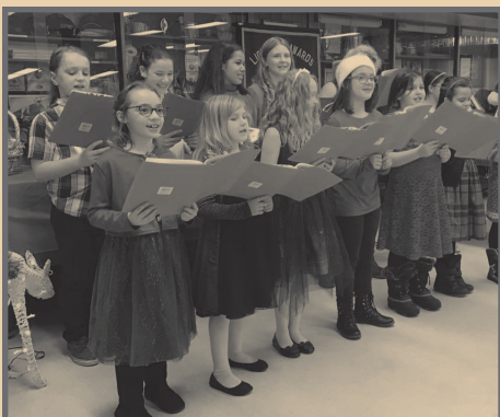
Members of the SPS Choir perform carols at the Schumacher Lions Club Seniors' Dinner.