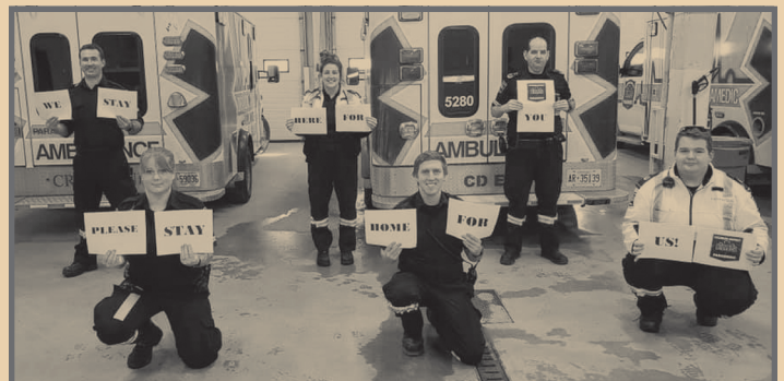
Cochrane District EMS posted this image to their Facebook page on March 21st. The message reads "We stay here for you. Please STAY HOME for us!". The six paramedics also demonstrate their ability to social distance within the confines of the ambulance bay in the CDSSAB building on Algonquin Boulevard.