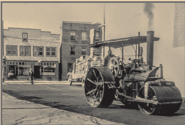
An old-time paver lays asphalt in front of 42 First Avenue (Father Costello Drive).