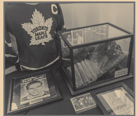
Some of the memorabilia on display at the Night For Bill gala and expo.