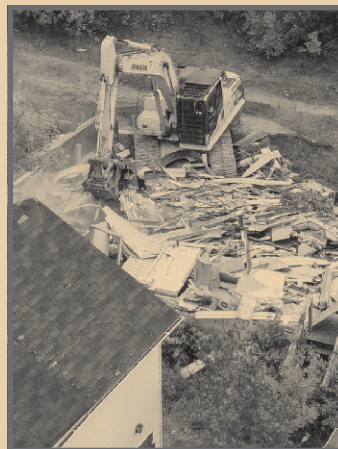
Top: With little fanfare, the iconic Grandview sign was removed from the building in August. Left: An outdoor classroom created from tree trunks has been installed at Schumacher Public School. Right: The demolition team from Priestly Demolition Inc. made short work of the back house at 34 Fourth Avenue.