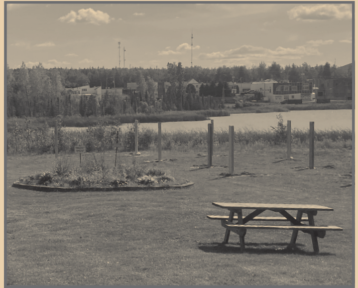
The Schumacher International Peace Park will overlook Little Pearl Lake. The Peace Poles will surround a flower garden. Site prep undertaken by the Schumacher Lions Club included the installation of 20 poles, placement of picnic tables, and laying of new sod.

Conceived both to help the Schumacher Lions Club rejuvenate the former McIntyre Park and to commemorate the 10th anniversary of the Schumacher Arts, Culture & Heritage Association, the Schumacher International Peace Park will consist of a Peace Garden, surrounded by creatively decorated Peace Poles with the message “May Peace Prevail on Earth” written in various languages spoken in the Timmins-Porcupine area. It will be an inclusive public space where people can reflect upon peace in a natural setting. The park will be officially dedicated on September 21, 2021 (the United Nations’ International Day of Peace). This project was made possible through partnerships with the City of Timmins, Newmont Resources, Timmins Local Immigration Partnership, Kirkland Lake Gold, and the Schumacher Foundation. Numerous other local businesses contributed to the project. Full details will be shared in the Fall 2021 edition of the Spirit of Schumacher newsletter.