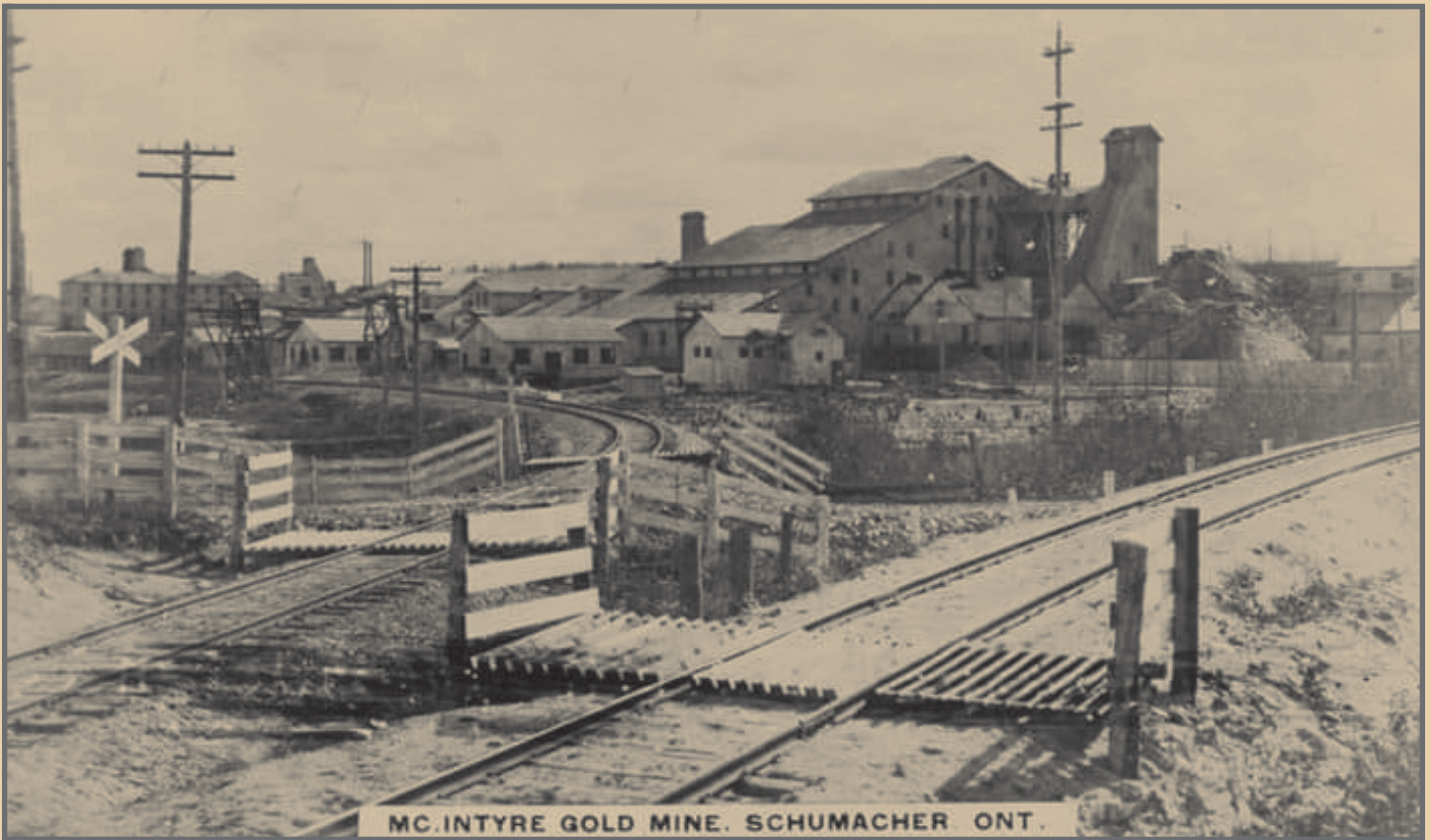
Above: The McIntyre Mine and townsite circa 1912-1913 showing the housing units built in front of the mill after the 1911 fire. Below: Travelling by canoe to the Main Gatehouse of the McIntyre Mine at Aura Lake in 1910.