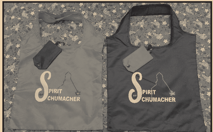
The SACHA Board enjoys gifting our supporters with tokens of appreciation. We hope you like your SOS shopping totes!