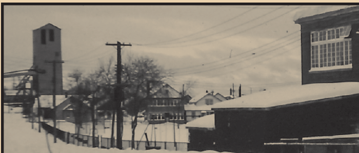
This view of #19 Shaft was taken looking west from Schumacher Public School sometime in the 1960s.