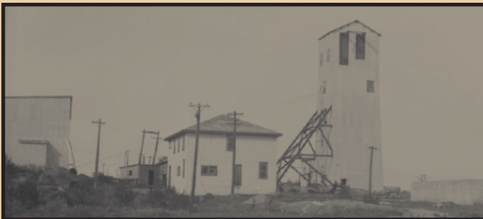
The original Schumacher Mine Headframe became Hollinger Consolidated #19 Shaft.