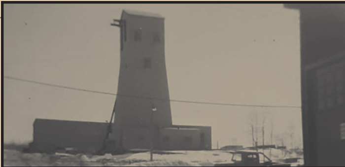
This 50s photo shows #19 Shaft located just across the street from the Schumacher Fire Hall.