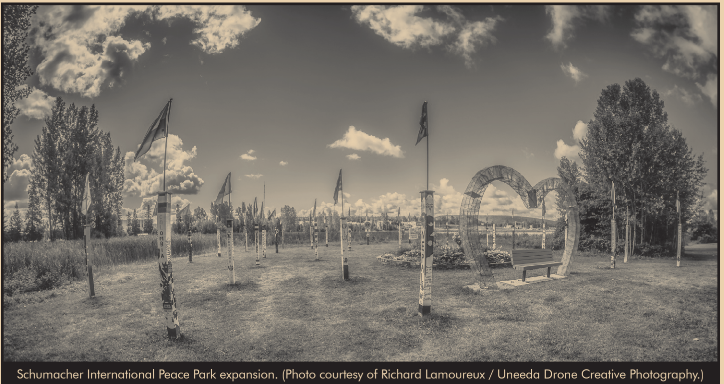
Schumacher International Peace Park expansion.

The second installment of peace poles at the Schumacher International Peace Park within McIntyre Park was celebrated on Saturday, July 29, 2023. About a hundred people were on hand as poles for Cameroon, Chile, Colombia, the Democratic Republic of Congo, Ghana, Greece, the Ivory Coast, Nepal, the Netherlands, Nigeria, South Africa and Trinidad & Tobago were unveiled. National flags were also purchased to fly beside each peace pole, including the original poles representing Africa, Austria, China, the Cree people, Croatia, Ecuador, the English community, the Francophone community, Germany, India, Italy, Jamaica, Japan, Mongolia, the Ojibwe people, the Philippines, Romania, Scotland and the Ukraine. In stark contrast to the heavy rain that brought the original dedication in 2021 to a hasty conclusion, this year's event boasted beautiful weather throughout the afternoon.