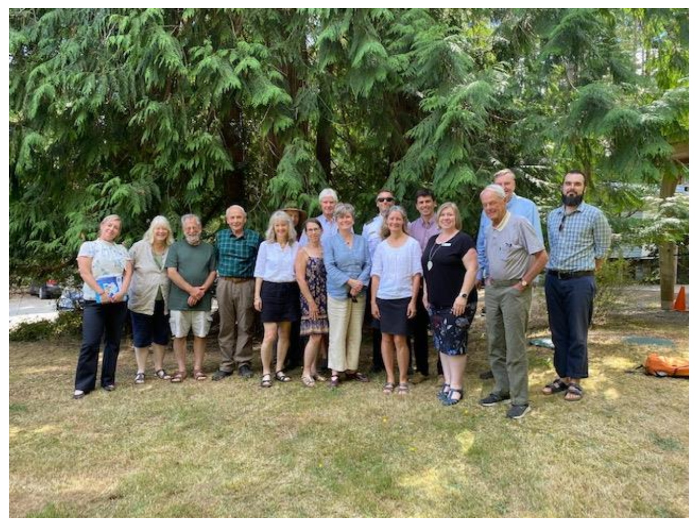
August 5, 2021

Almost 3 years ago, the Denman Island Residents Association and the Hornby Island Community Economic Enhancement Corporation formed the Hornby Denman Internet Committee to address the chronic, inadequate internet service on the Islands. On November 27, 2021, the citizens of the Islands will vote on endorsing establishing a broadband service for the Islands' share of funding for "last mile", high speed fibre-optic internet to Hornby and Denman Islands. For more information: www.HornbyDenmanInternet.com