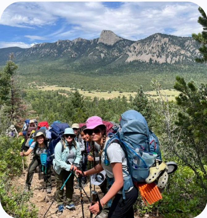
Troop 500G Having A Blast At Philmont!