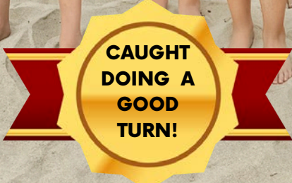
PACK 752 BEACH CLEAN-UP