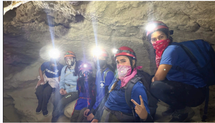
TROOP 226 MUD CAVES NEAR AGUA CALIENTE