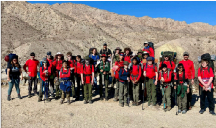
TROOP 616 FISH CREEK HIKE