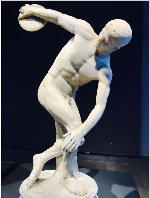
Discus Thrower, Palazzo Massimo, Rome, Symbol of ATHLETIC SPIRIT