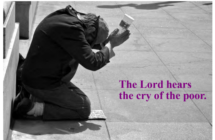
The Lord hears the cry of the poor.

Jesus addressed this parable to those who were convinced of their own righteousness and despised everyone else. "Two people went up to the temple area to pray; one was a Pharisee and the other was a tax collector. The Pharisee took up his position and spoke this prayer to himself, 'O God, I thank you that I am not like the rest of humanity -- greedy, dishonest, adulterous -- or even like this tax collector. I fast twice a week, and I pay tithes on my whole income.' But the tax collector stood off at a distance and would not even raise his eyes to heaven but beat his breast and prayed, 'O God, be merciful to me a sinner.' I tell you, the latter went home justified, not the former; for whoever exalts himself will be humbled, and the one who humbles himself will be exalted."