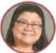
Guia UNITED STATES (PHILIPPINES)