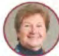
Barbara UNITED STATES