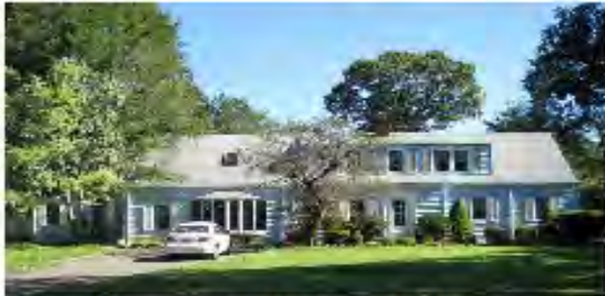
Harvest House located in Syosset, NY.