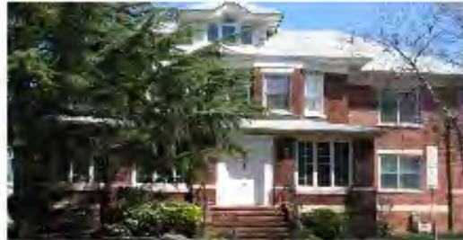
Harvest Park located in Floral Park, NY.