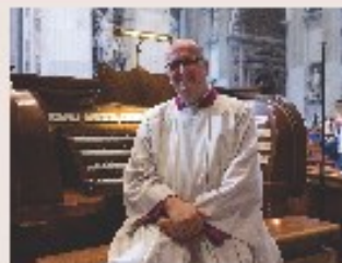
FEATURING JOSEP SOLE COLL FIRST ORGANIST OF THE PAPAL BASILICA OF ST. PETER'S (VATICAN)