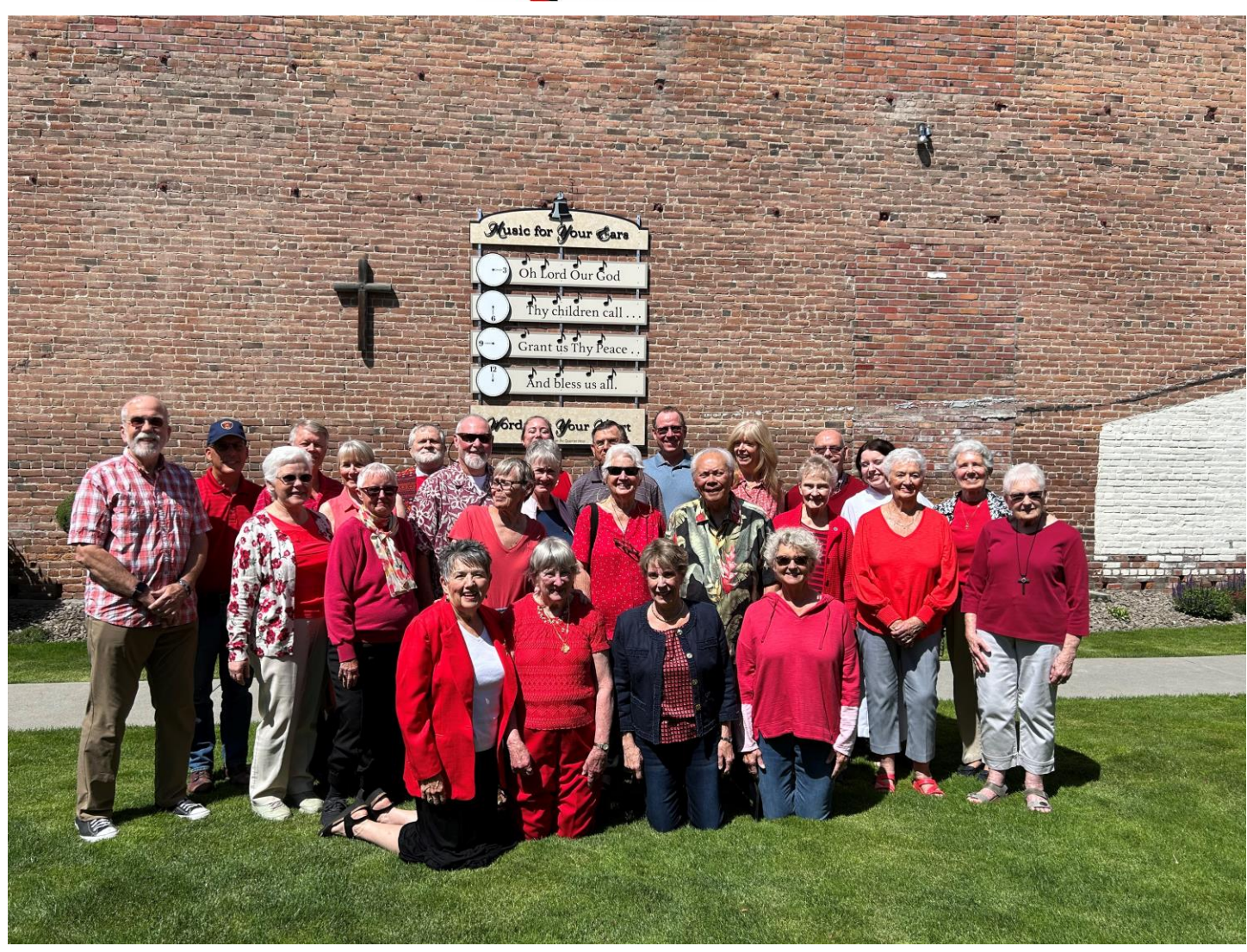
St. Andrew's Episcopal Church congregation – May 28, 2023