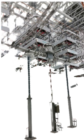
Thyristors Keewatinohk Converters Site C Hydro –Kitimat, B.C.

Every second of every day, IBEW members touch so many lives across the country. But it's not just about electrical construction and repair. It's about enriching the communities in which we live, work, and play.