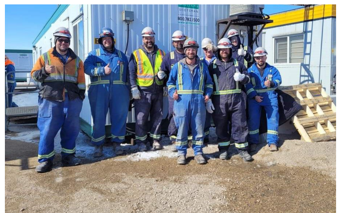
Nutrien Potash Site, Allan, Saskatchewan

IBEW members work in a wide range of sectors. We bring superior skills and real-world experience every day to cities, towns, and municipalities across this country.