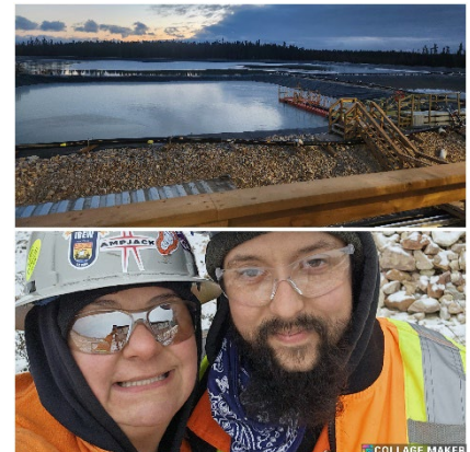
McEllvena Bay Northern, Saskatchewan

Every second of every day, IBEW members touch so many lives across the country. But it's not just about electrical construction and repair. It's about enriching the communities in which we live, work, and play.