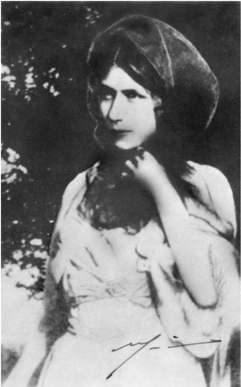
The Mother in Algeria, 1906-1907