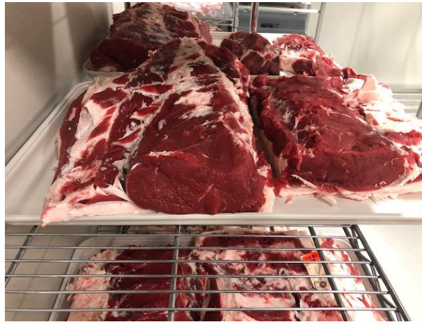
Rib Eye Primal

We never expose or disturb the spinal cord with our patented meat processing system. This greatly reduces the concern for any diseases or contamination from the nervous system.