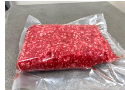
Vacuum Packed Ground Meat (Comes in 1 to 1 ¼ lb. packages)

With this unique process, we are able to strip the carcass thoroughly to the bone, reducing waste and optimizing meat yields.