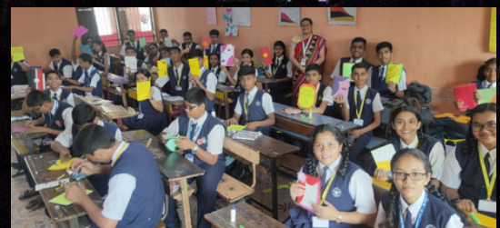
9B students , CA period = Greeting card making