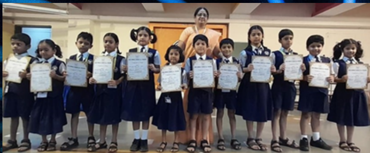
Intramural English handwriting winners group A