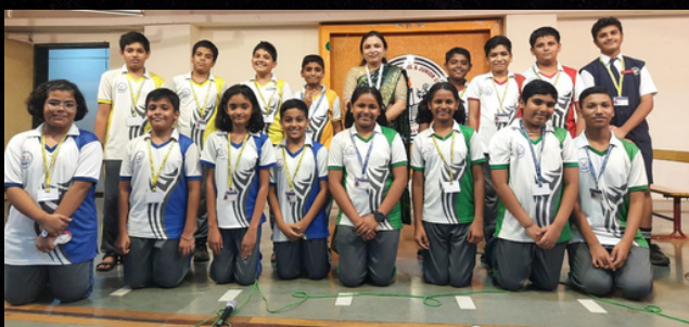
Intramural quiz competition