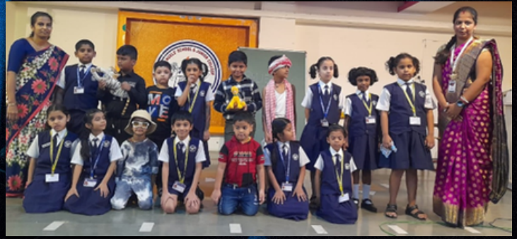
•Assembly theme: believe in yourself