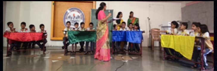
•Group A intramural quiz competition conducted on 30/10/23