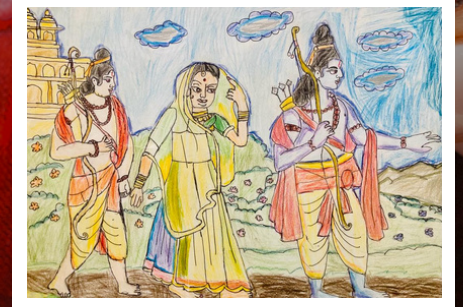
Ekansh Chorge III D