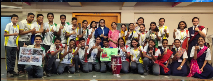
•Assembly of 9th D