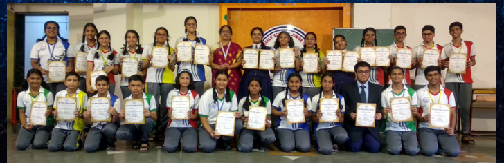
Secondary Intramural Winners