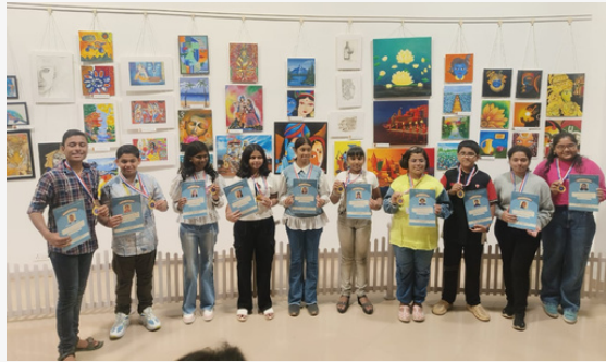
The Artistic Students of our school exhibited their Exclusive Creations at Nehru Art Gallery Mumbai, under the guidance of Art Teachers