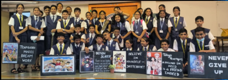
•Assembly of 9th C