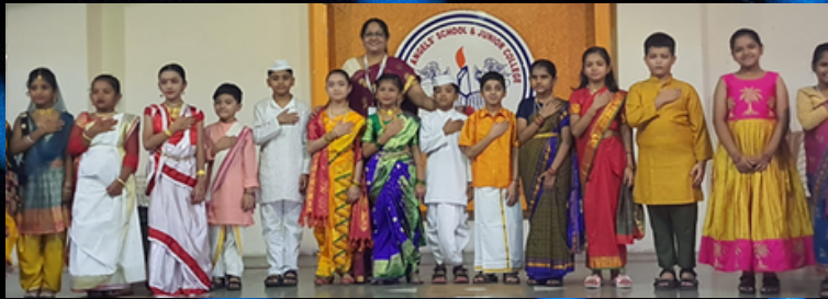
Assembly theme: Unity in diversity Std 3 to 5