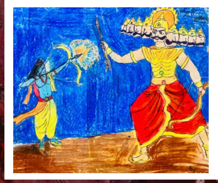
Yuktha Vivek III D