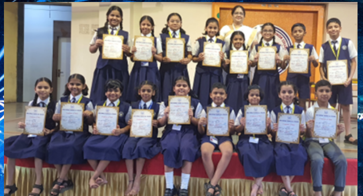
Intramural English handwriting winners group B