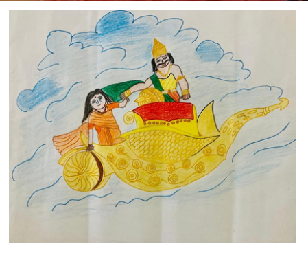
Anany Baji III D