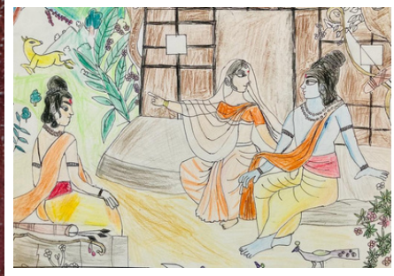
Parth Kolge III D