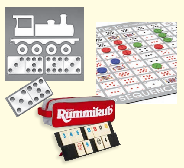
TABLE GAMES (DOMINOES, RUMMIKUB & SEQUENCE) AT FIVE PONDS EVERY THURSDAY EVENING