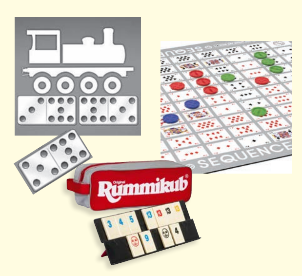
TABLE GAMES (DOMINOES, RUMMIKUB & SEQUENCE) AT FIVE PONDS EVERY THURSDAY EVENING