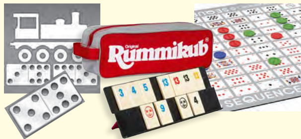
TABLE GAMES (DOMINOES, RUMMIKUB & SEQUENCE) AT FIVE PONDS EVERY THURSDAY EVENING