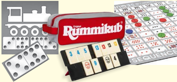
TABLE GAMES (DOMINOES, RUMMIKUB & SEQUENCE) AT FIVE PONDS EVERY THURSDAY EVENING