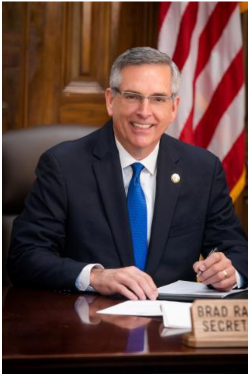
Secretary Brad Raffensperger Georgia Secretary of State

Brad Raffensperger is Georgia's 29th Secretary of State, first elected in 2018 and re-elected in 2022. Secretary Raffensperger was elected to the City Council in Johns Creek, Georgia. Three years later he was elected to the Georgia House of Representatives where he then served for two terms, and in 2018 Georgia voters elected him Secretary of State. The Secretary's top priority is secure and accessible elections. As Secretary of State, Raffensperger delivered the largest implementation of voting machines in the history of this country, on time and on budget. Under Raffensperger's leadership, Georgia modernized its election system by adding its first auditable paper ballot system and giving the power to secure Georgia's elections directly to the voter. He is the first Secretary of State to pass legislation requiring photo ID for all forms of voting, and first to hold counties accountable to voters by expanding polling places.