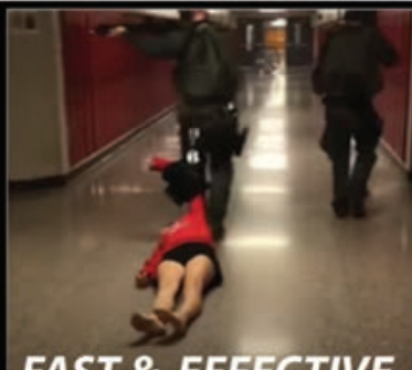
FAST & EFFECTIVE Active Shooter Rescue Deployment