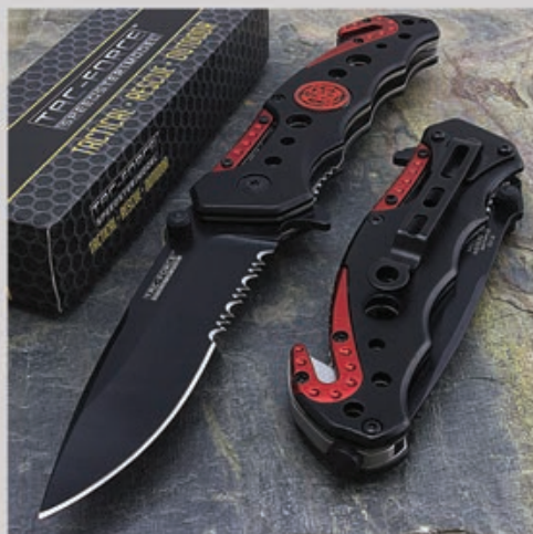
RED & BLACK - FIREFIGHTER $24.99

4.5" Aluminum Handle - Seat Belt Cutter - Glass Breaker - Belt Clip