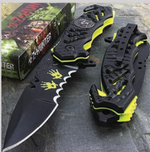
Z - HUNTER $24.99