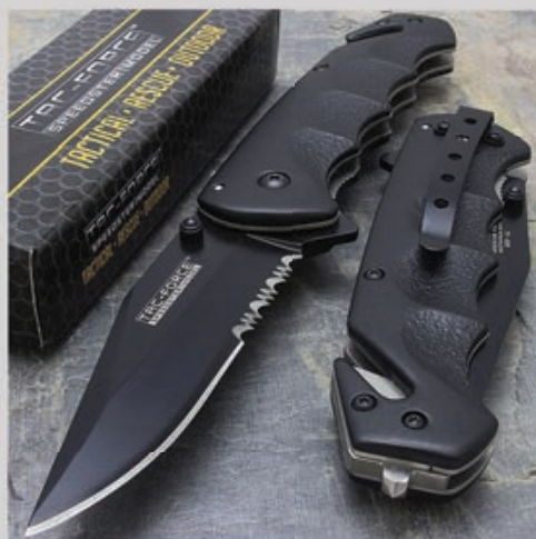
BLACK OPS $24.99