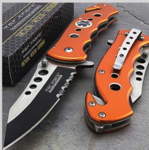
ORANGE - EMS $24.99