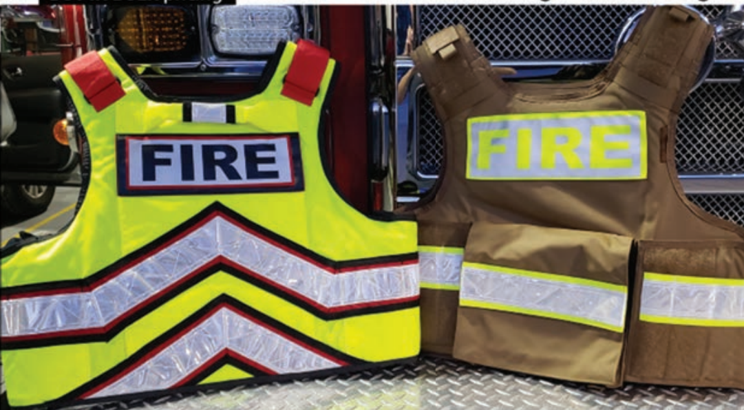
Fire Ninja PROTECTOR Level IIIA soft armor ballistic Carrier with multiple plate options

The Fire Ninja PROTECTOR Universal Plate Carrier is designed around the most demanding conditions that Fire / Rescue, EMS and Law Enforcement have to face every day. The PROTECTOR design is a one size fits most, the oversize cummerbund has 3 points of expansion to fit a broader range of users and offers the best side coverage in the industry. The PROTECTOR will accommodate all sizes of optional hard armor rifle plates, Level III & IV in the front and back affording better coverage for the user based on body size.