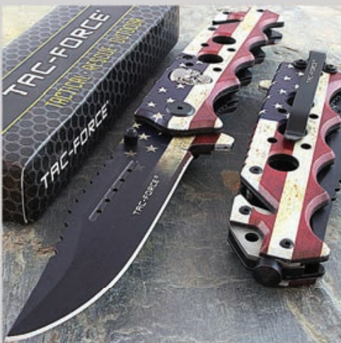
USA SKULL $24.99