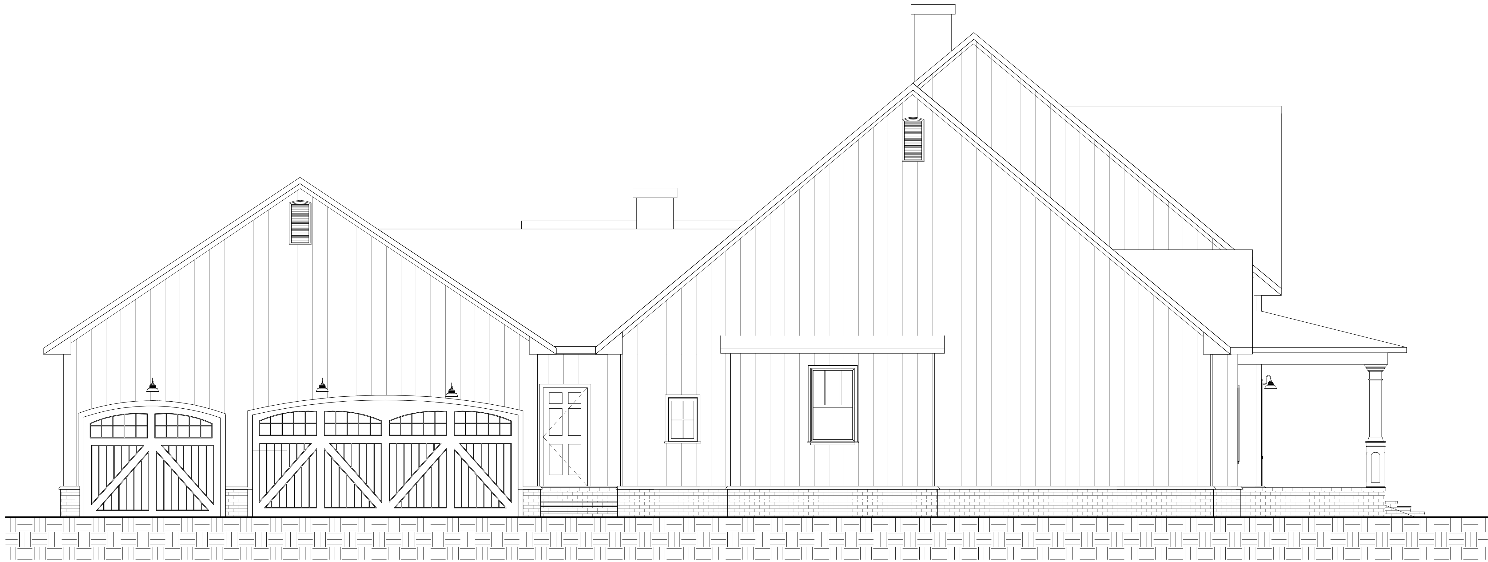
② Left 1/4" = 1'-0"

IT IS THE SOLE RESPONSIBILITY OF THE CONTRACTOR AND/OR BUILDER TO CONFORM TO ALL STANDARDS, PROVISIONS, REQUIREMENTS, METHODS OF CONSTRUCTION AND USES OF MATERIALS, IN BUILDING CODES AND OTHER LOCAL AGENCIES AND IN ACCORDANCE WITH GOOD ENGINEERING AND CONSTRUCTION PRACTICES.