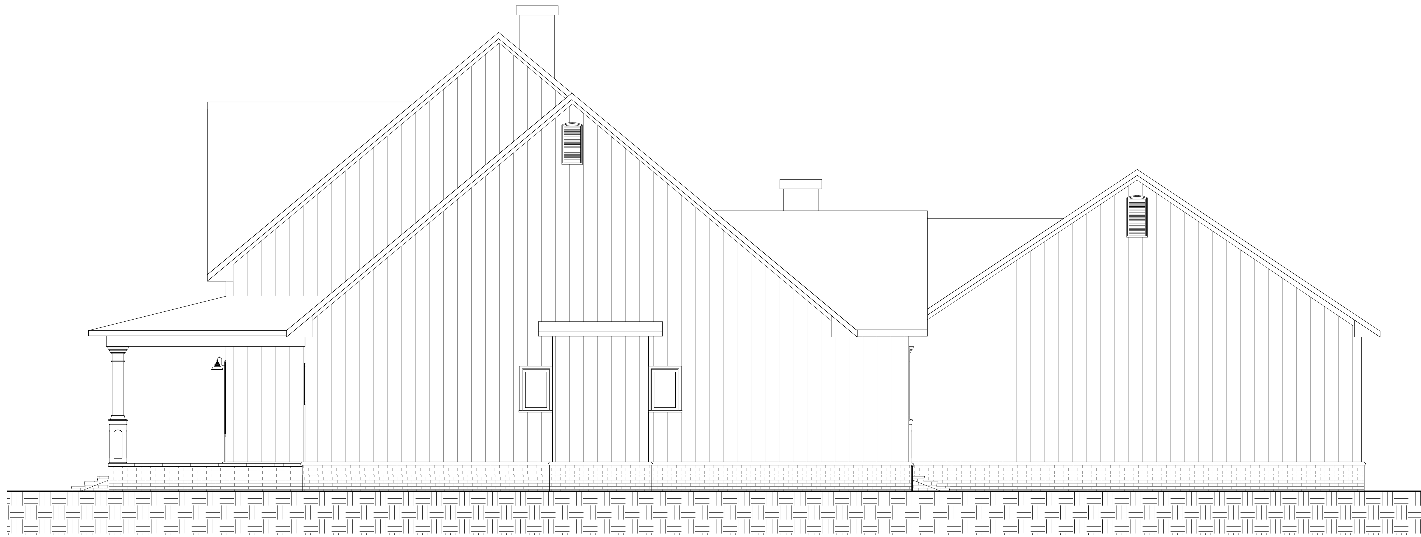
① Right 1/4" = 1'-0"