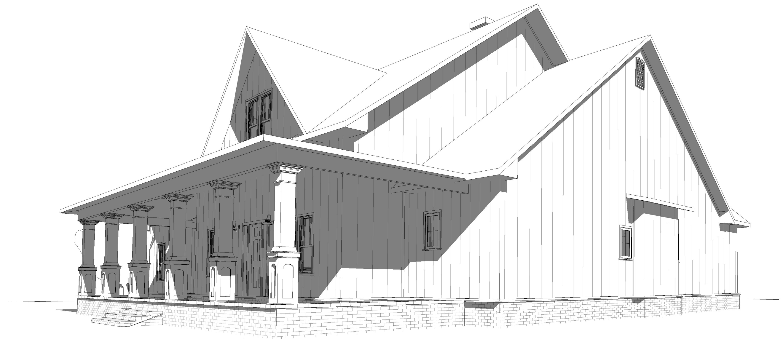
③ Exterior East