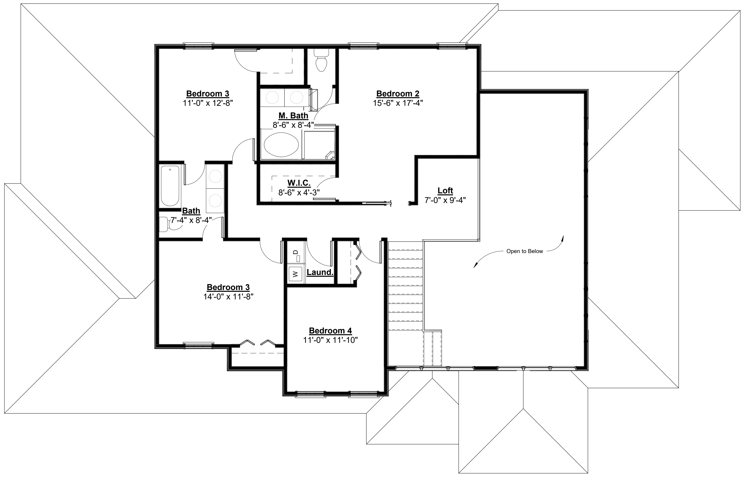
2 Second Floor Prelim 3/16" = 1'-0"