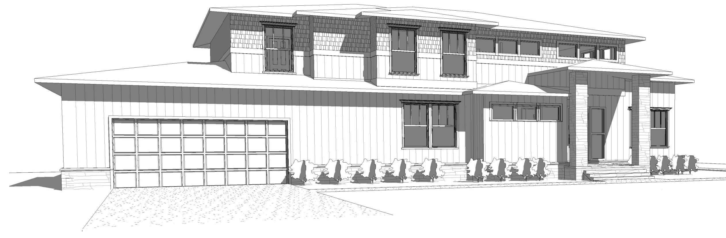
4 Exterior West