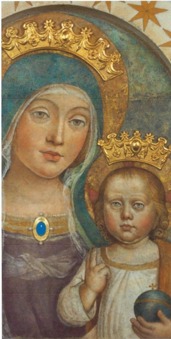
The ancient fresco of Madonna del Soccorso (Our Lady of Help) in St. Peter's Basilica was restored with the support of the Knights of Columbus to mark the Year of Faith (2012-2013).

O Mary, you always brighten our path as a sign of salvation and of hope. We entrust ourselves to you, Health of the Sick, who, at the Cross, took part in Jesus' pain while remaining steadfast in faith.